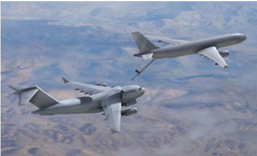
A KC 30 refuels a C17 transport aircraft

111 tonnes. These figures represent a significant increase over the current B707; most telling being the capability to offload over 65 tonnes of fuel at 1000 nm from base, representing a 147% increase in the operational envelope. The modern systems utilised within the aircraft also offer a significant increase in reliability and efficiency—airlines have achieved a 98% dispatch rate for the A330. However, because of the increased size of the aircraft there is a limitation on airfields from which it can effectively operate, particularly at high gross weights.