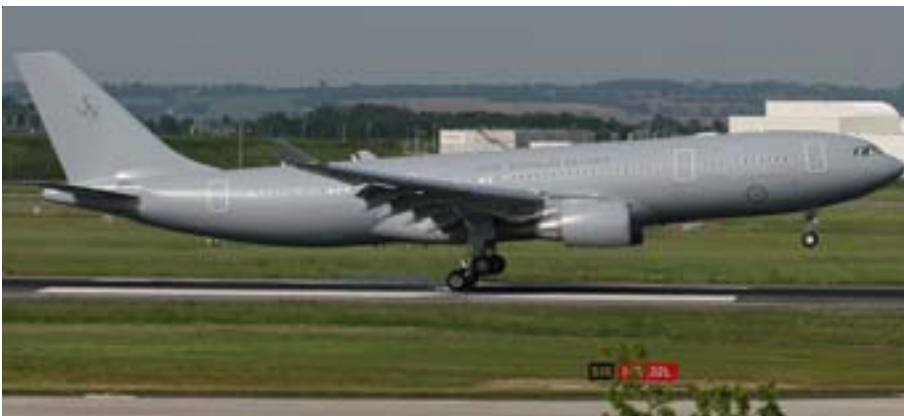
The first KC-30B for the RAAF touches down

Article reproduced with permission of Air Power Development Centre, RAAF