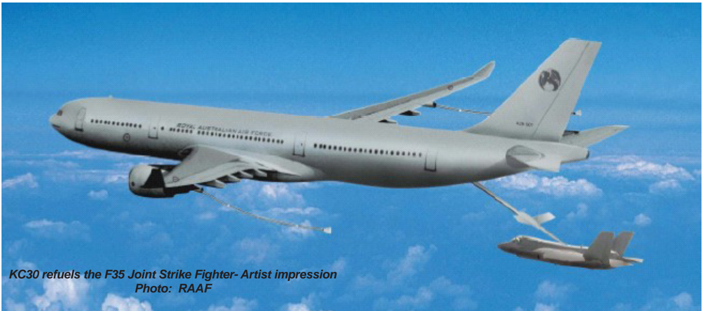
KC30 refuels the F35 Joint Strike Fighter- Artist impression

The ability of strategic airlift and air-to-air refuelling (AAR) to increase operational combat options makes them extremely valuable capabilities. This contribution to operations has shaped development toward the multi-role capable aircraft being acquired by the RAAF and considered by virtually all other modern air forces, including the USAF.